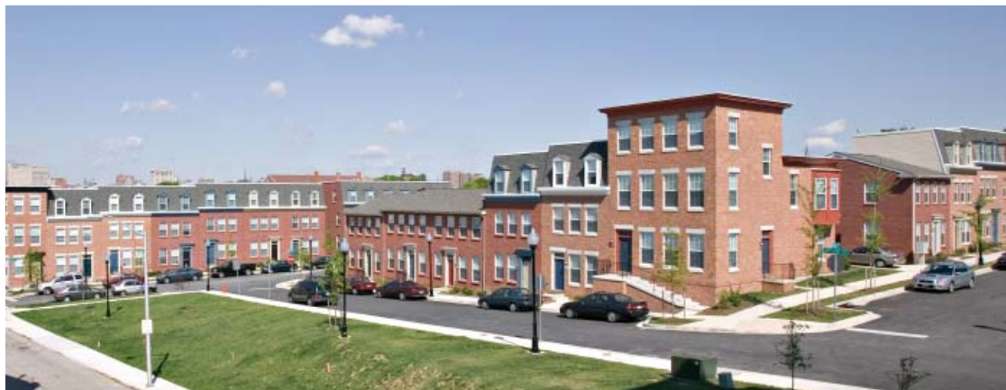
Group of houses with corner building designed to create continuous residential frontage on all streets.