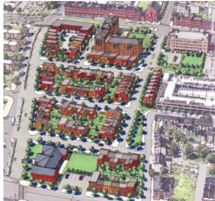
Left Aerial view from the west after redevelopment.

The small scale network of streets around it are lined with townhouses which continue the architectural traditions of Washington Hill. They are a mixture of rental and homeownership units as well as a mix of subsidized and market-rate homes. A pre-existing parking garage is now screened from the neighborhood by a row of townhouses, and a small park provides an amenity for the larger neighborhood as well as this development.