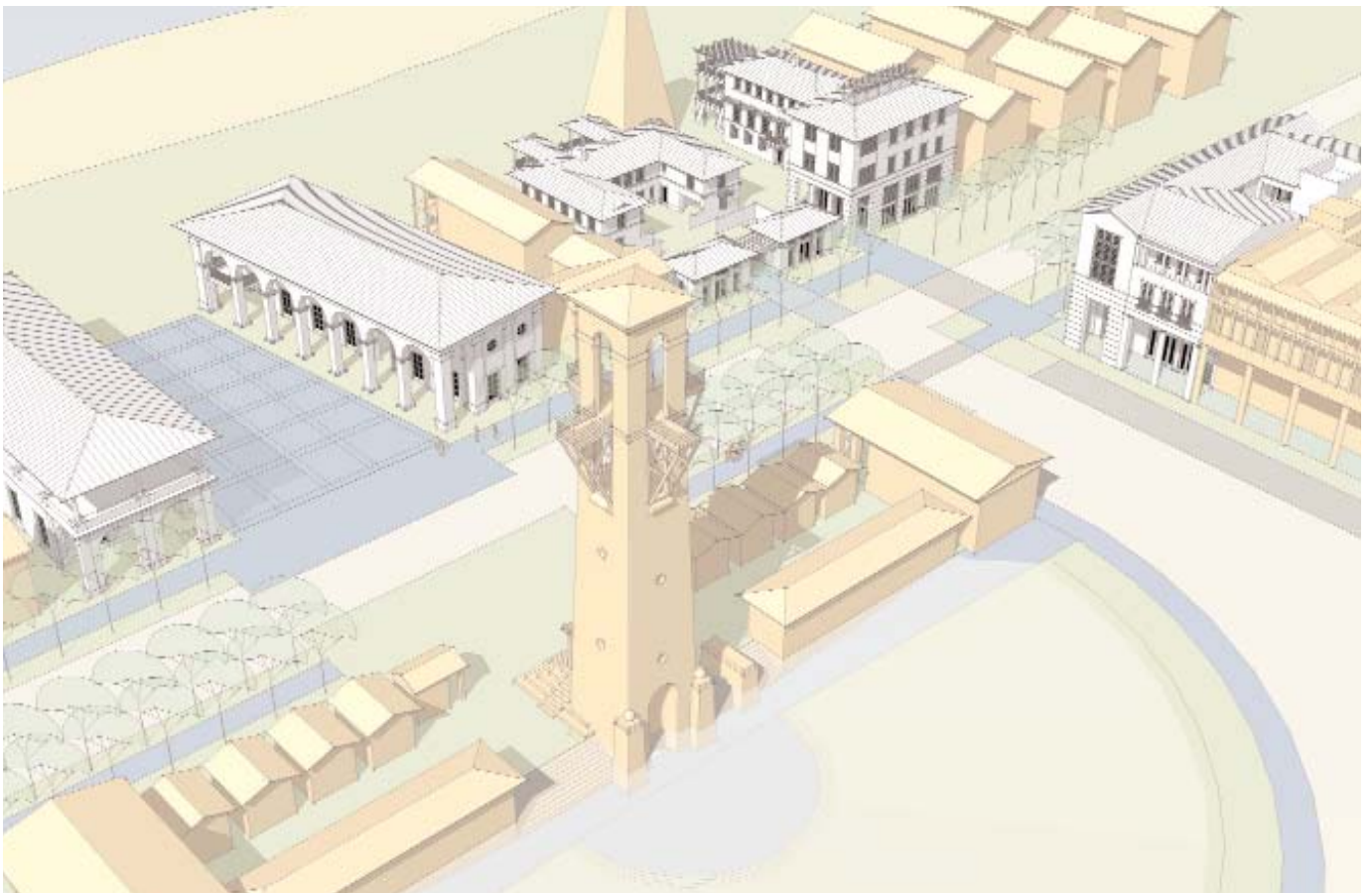
View of the Town Center and the Gateway Building