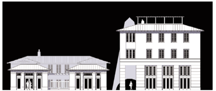
Southwest Gateway Building and Piazza - North Elevation